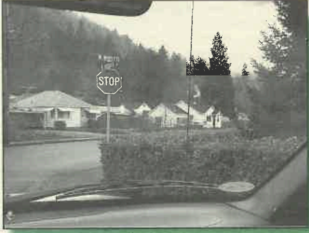
This neatly trimmed hedge provides good traffic visibility

In order to maintain clear vision for traffic, there should be no obstruction on corners between 3 feet and 12 feet in height. The only exceptions are poles, posts and tree trunks. Tree trunks have to be pruned 8 feet above curb height. The property owner is responsible for ensuring landscaping complies with these guidelines.