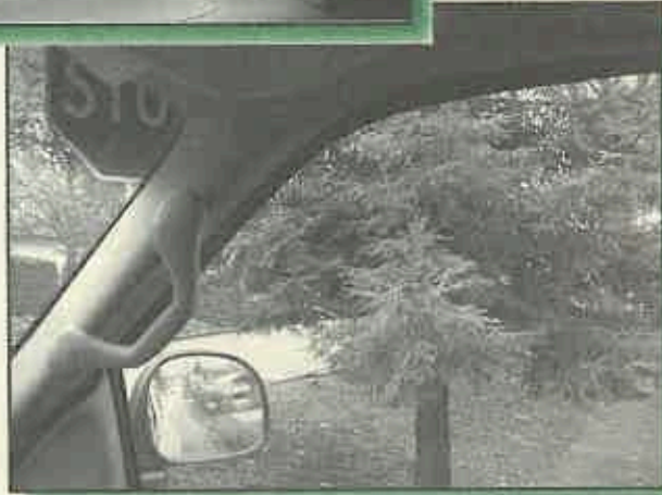
This tree obstructs the view of oncoming traffic.