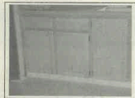
Home in the Mill-Pine Neighborhood before and after housing rehab work.