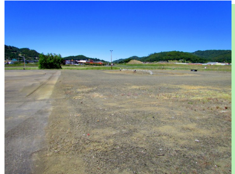
Back portion of lot facing north