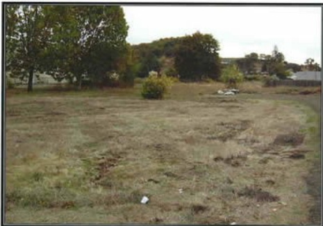
Southerly view of the subject property from Ward Street