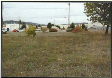
Northerly view of the subject property