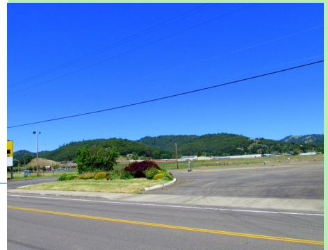
Lot entrance from Aviation Drive