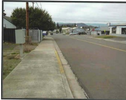
Street scene, facing east on Ward Street, the subject property is located on the left

In 2003 the City's Urban Renewal Agency purchased multiple properties to accommodate parking for Dell. With Dell's departure, those properties have now been determined to be surplus to the City's needs. Therefore, the City is offering for sale property located at 1112 and 1152 NE Post Street. This 0.78 acre (33,977 square feet) parcel is zoned for multiple use and is ready to build. All utilities are on property. Asking price of $195,000. If anyone is interested in this property, should contact City Recorder Sheila Cox at 541-492-6866 or scox@cityofroseburg.org .