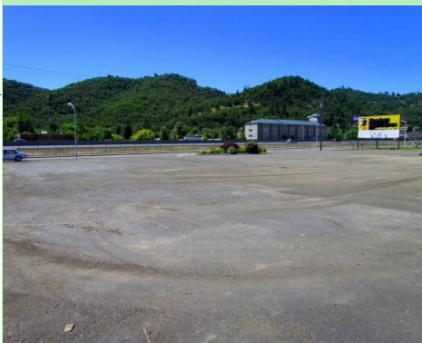
Lot facing west towards I-5 and billboard