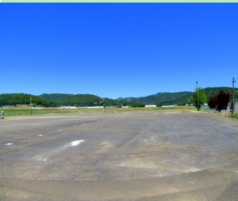
Lot facing east towards Roseburg Municipal Airport