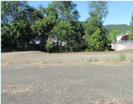
Jackson Street property today after demolition and clean-up