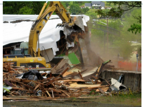
Demolition began May 31, 2011