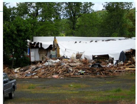
Demolition - May 31, 2011