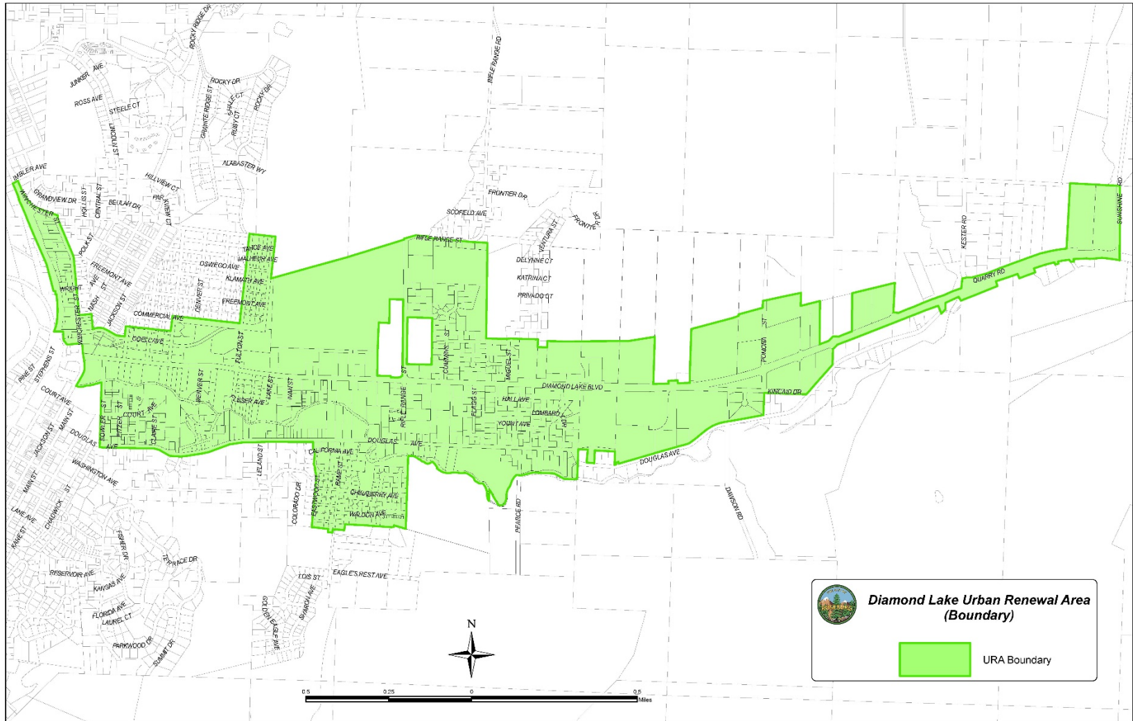
Figure 1 - Diamond Lake Urban Renewal Area Boundary