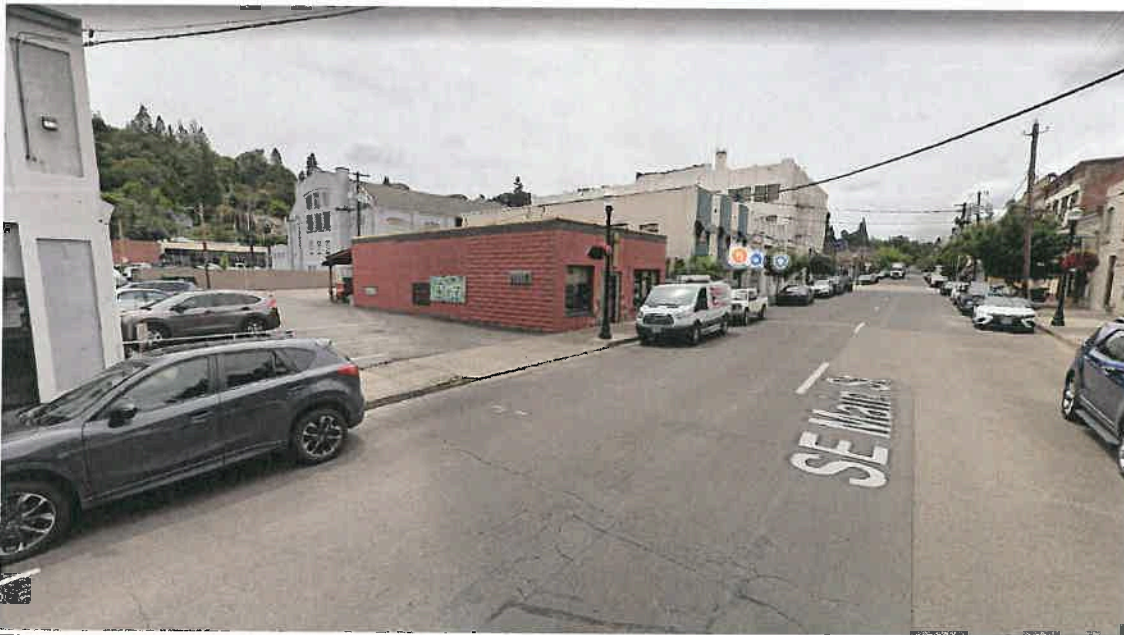
The above image shows the project site, as seen from SE Main St.