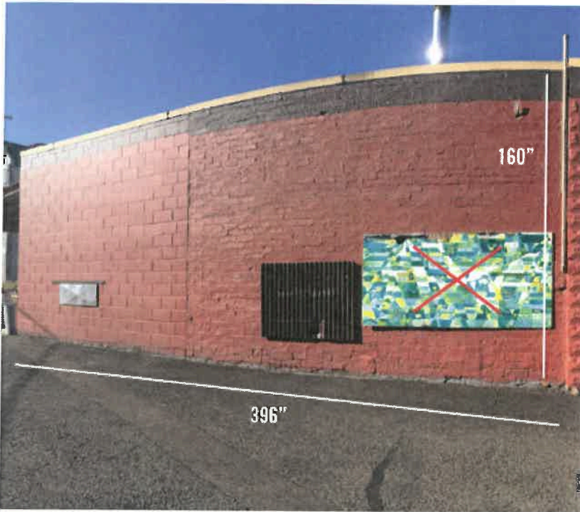
The above image shows the applicant's proposed project site.

The below images show the subject property located at 525 SE Main St.