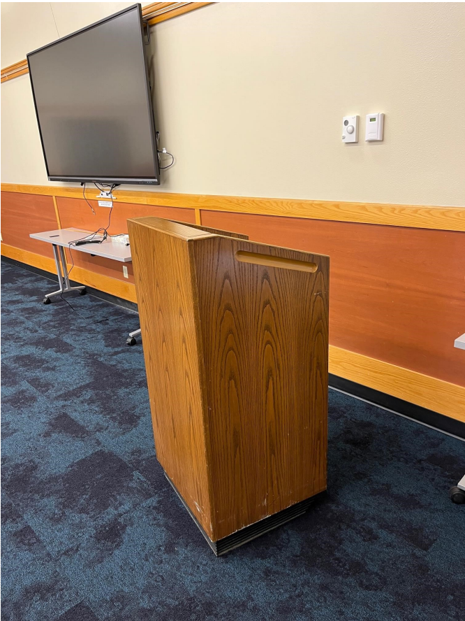
Lectern for use subject to availability.