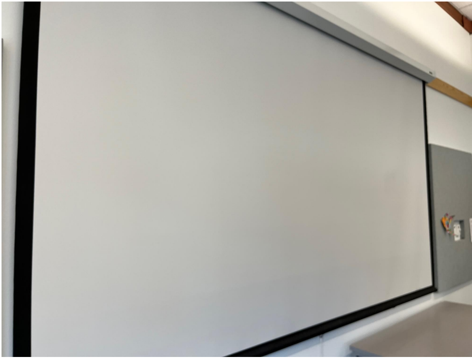
Large screen available.