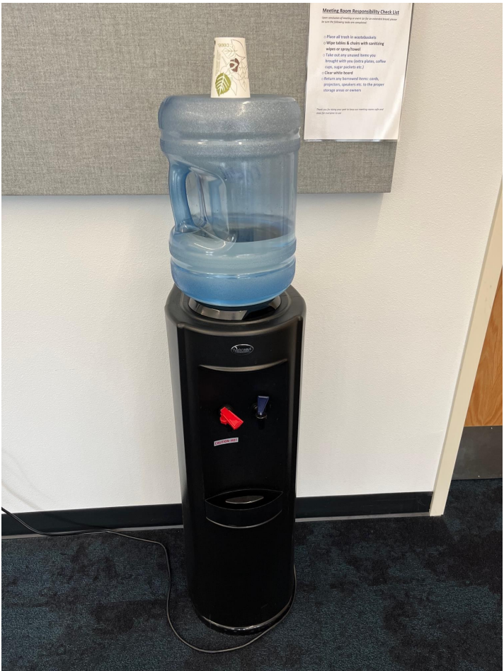
Water and cups available.