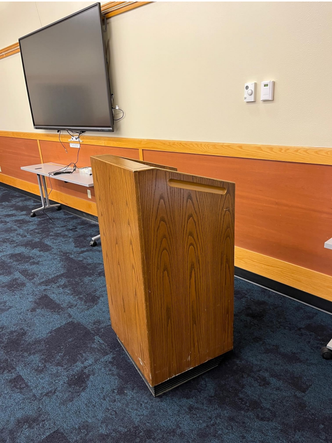
Lectern for use subject to availability.