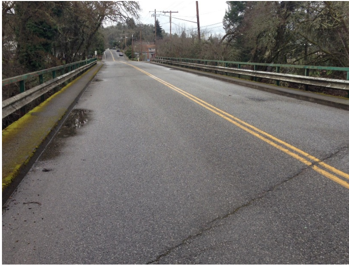
Douglas Ave. Deer Creek Bridge

In March, 2019, the City of Roseburg was awarded a grant through the ODOT Local Bridge Program for design of a replacement bridge on Douglas Avenue over Deer Creek. In October 2020 the City applied for a similar grant for the construction of the project. The funds shown below are for 50% of the required City grant matching funds. The remainder will come from the Transportation fund.